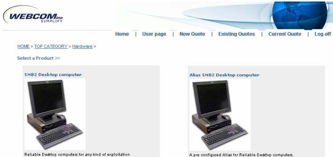
Figure 16-4 User view of Alias

When user logs in they will see the Alias positioned according to its ranking. In Figure 16-4 the ranking is 2. Figures 16-5 and 6 show the differences when first selecting each product. The master product is the base with no attributes selected.