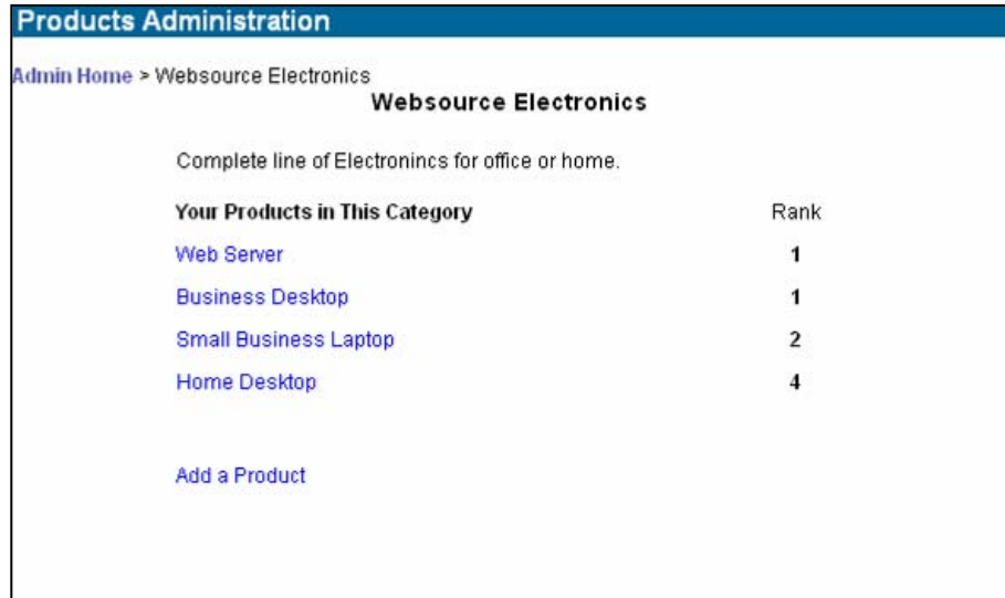
Figure 12-2 - Product Administration – Existing Products

Selecting the Category from this list will bring up the Product Administration page that displays any current products for that Category as shown in Figure 12-2.