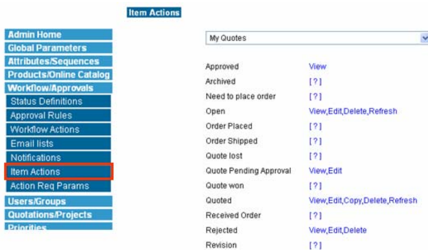
Figure 10-1 Item Actions

The left column in the Item Actions screen is the quote status. The right column shows the actions that can be performed on items. Figure 10-1 is an example showing that the individual items in a quote can be viewed , edited , deleted , and refreshed while a quote is in the Open status.