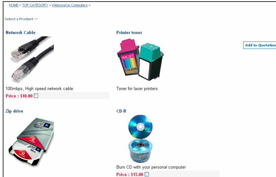
Figure 3-3 Products

Selecting an existing product or Add Product opens the Product Definition page where specific product details are added. Refer to the Chapter PRODUCT DEFINITION for further information on editing product information.