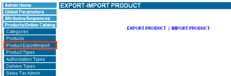
Figure 25-1 – Export/Import Product

In order to export a product, select the product Export/Import link under the Products/Online Catalog drop down.