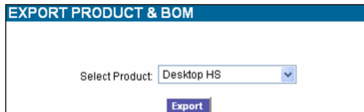
Figure 25-2 – Export Product and BOM

Select the product to be exported from the drop down list and then click Export.