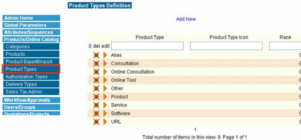
Figure 11-1 – Product Types Definition

Selecting the Product Types link under the Products/Online Catalog drop down accesses Product Types Definition shown in Figure 11-1 where Product Definitions can be Deleted or Edited.